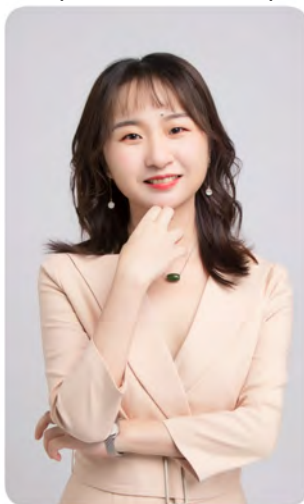
Audit, Deloitte, Hong Kong, China