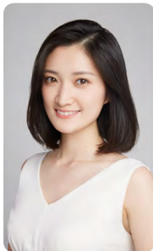
Joined EY Qingdao, now vice secretary of a talent think tank in Shenzhen